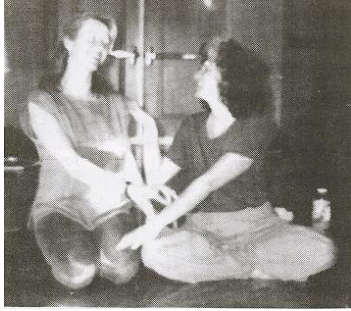
Association.